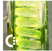
Heat transfer fluids