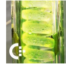
Heat transfer fluids